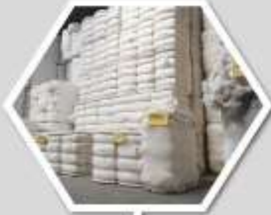
COTTON BALES Online scanners at stock