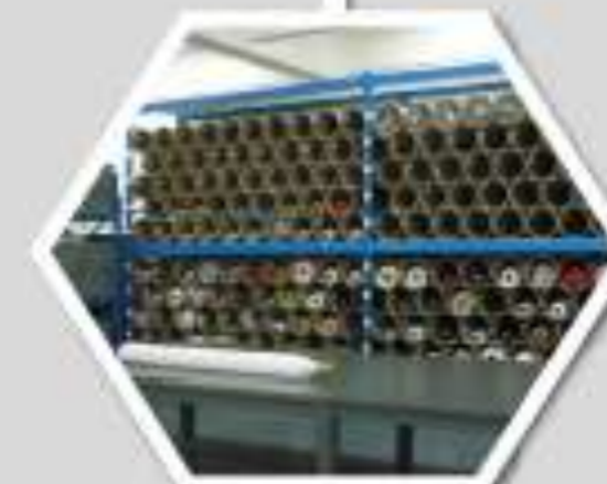
FABRIC SAMPLE ROLL STOCK Inventory record and handling of samples