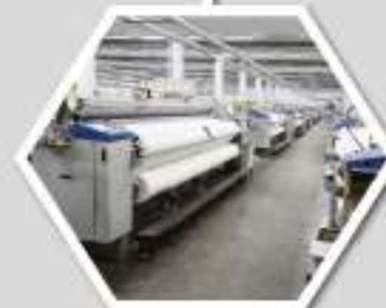
WEAVING LOOM PDC in weaving/knitting: vendor independent