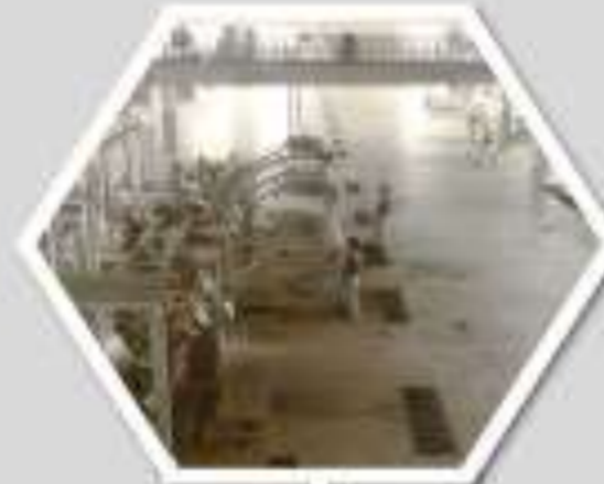
DYEING PDC in dyeing through interfaces to dosing, balances, dyeing machines