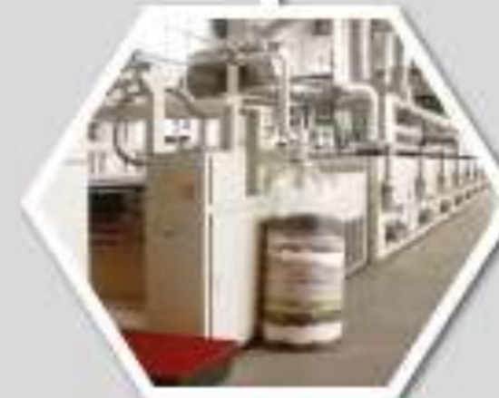
STENTER FRAME PDC in finishing department – Ind. recipe management