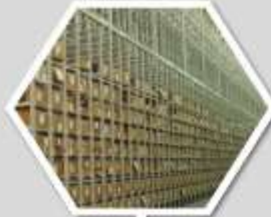
YARN STOCK Automated yarn stock