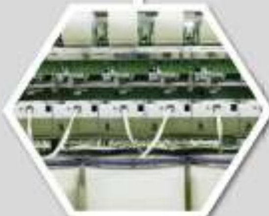
SPINNING PDC in spinning process