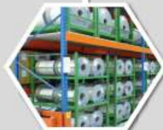
WARP STOCK Warp stock management