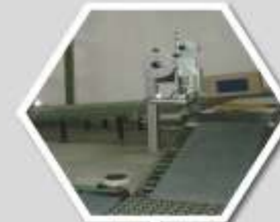
AUTOMATED WEIGHTING AND LABELING Automated dispatch integrated