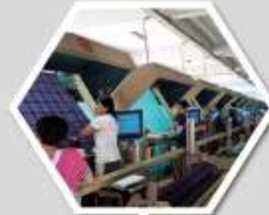
QUALITY INSPECTION PDC in quality inspection – all faults are registered per piece