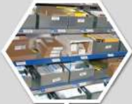
SPARE PARTS STOCK KEEPING Inventory record keeping of spare parts