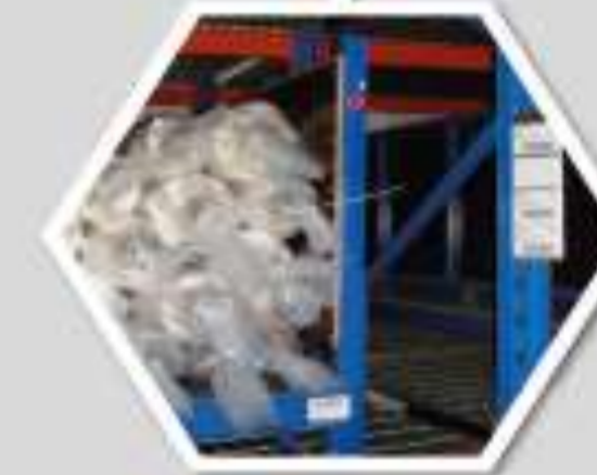
FABRIC ROLL SINGLE STOCK Lot Size 1 enabled